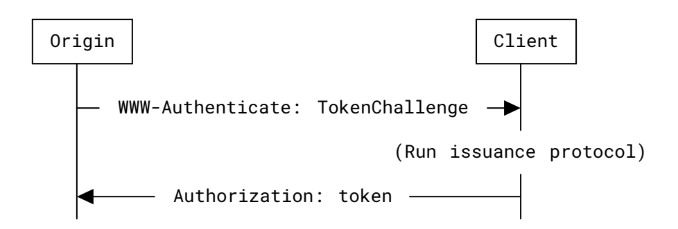
Figure 1: Challenge and Redemption Protocol Flow

In addition to working with different token issuance protocols, this scheme optionally supports the use of tokens that are associated with Origin-chosen contexts and specific Origin names. Relying parties that request and redeem tokens can choose a specific kind of token, as appropriate for its use case. These options (1) allow for different deployment models to prevent double-spending and (2) allow for both interactive (online challenges) and non-interactive (prefetched) tokens.